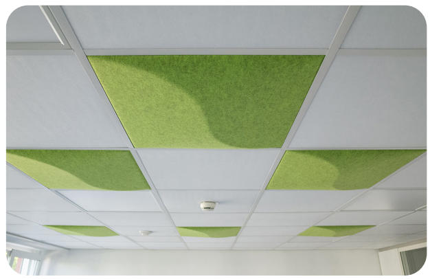
Ceiling design with soni COLOR Design YinYang