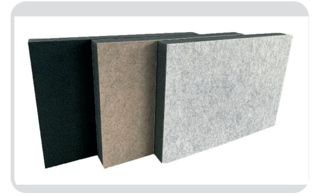
Colors decorative felt: black, beige or light grey